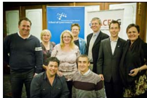
Some of the ELGLP graduates at the graduation dinner.