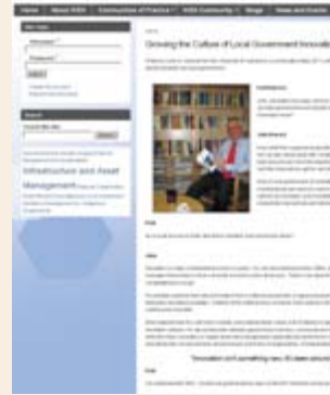
A screenshot of the upcoming Innovation and Knowledge Exchange Network ( IKEN )

in Canberra. Its goal was to coordinate, align and leverage local government workforce initiatives in relation to the establishment of a National Local Government Workforce Data Set, and the completion of a draft National Local Government Workforce Strategy as part of the National