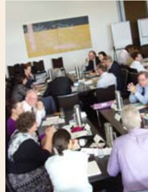
A working group at the Local Government Climate Change Roundtable.

Key actions agreed to by the roundtable were to seek to ensure that nationally consistent frameworks are developed for use by local government, that platforms for sharing innovation and new ideas around climate change action are established, and that local government takes more of the