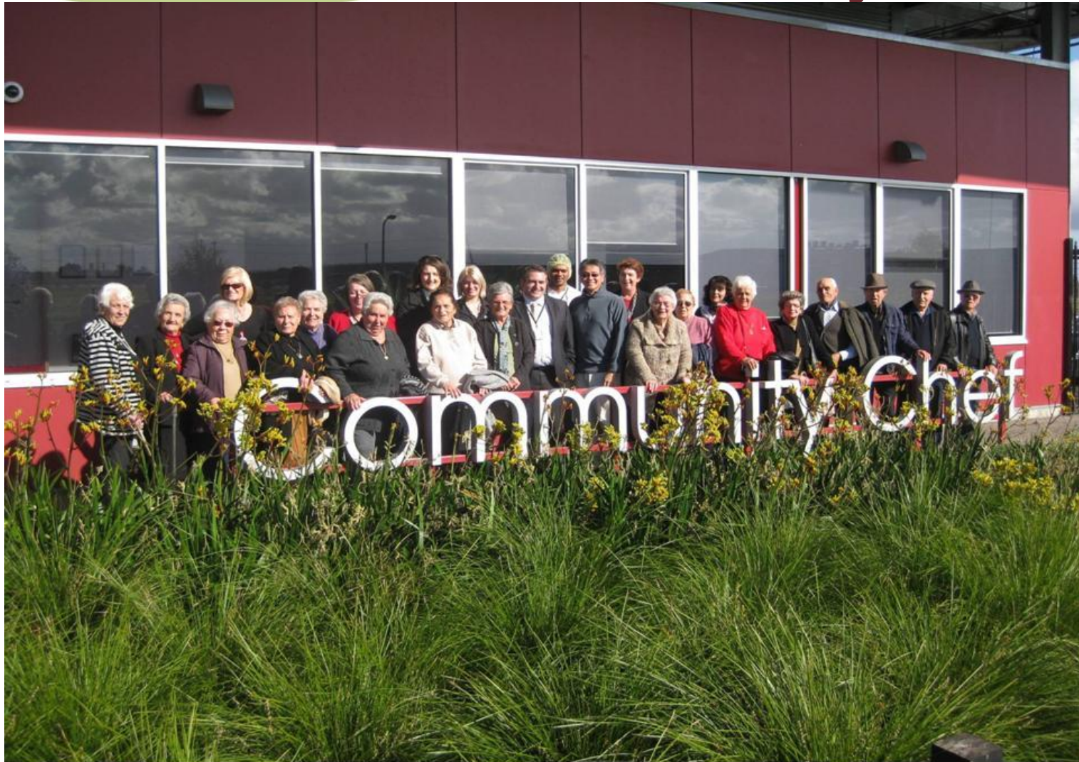
Manningham Council - Casa Mia Italian PAG Group Community Chef site visit, May 1 st 2012