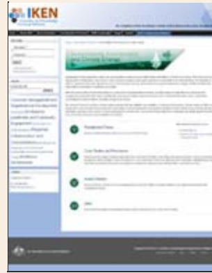
A screenshot from the Innovation and Knowledge Exchange Network ( IKEN ) showing a 'Community of Practice'.

As mentioned in our March edition (#2) ACELG has initiated